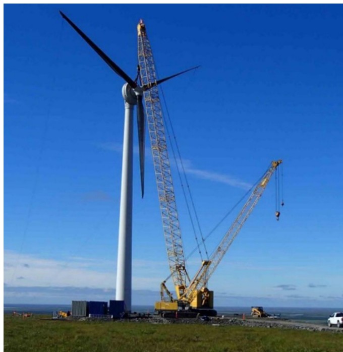
The 900 kW wind turbine constructed in Pitka's Point, AK, serving three local communities, helps offset diesel fuel use and mitigate risk of fuel shortage [1].

One of the biggest benefits distributed wind provides is the ability to provide power locally without importing fuel and in areas where solar resources are not adequate. In this way, it can be used to offset fossil fuel consumption and support local backup power needs in the case of a wider grid outage. As a local generation source, it can help relieve transmission congestion and decrease line losses. It can also act as a peak shaving resource using curtailment or paired with energy storage for the asset owner or purchaser, whether that is a distribution utility managing their overall load or a consumer with a resource behind-the-meter.