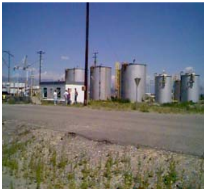
Figure 2. CFA-42 prior to removal action.