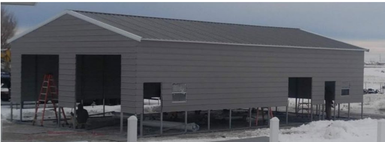
Figure 2-3. Example of the Steel Structure