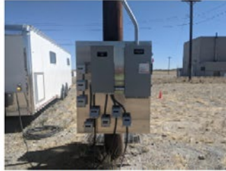
SIMILAR INSTALLATION AT PAD D FOR REFERENCE

SCOPE: EXTEND MEDIUM VOLTAGE POWER LINES TO THE UAV RUNWAY. NEW POLES WILL BE SET APPROXIMATELY AS SHOWN IN THE AREA LOCATION PLAN ON THIS SHEET. A POLE MOUNTED TRANSFORMER WILL BE PROVIDED TO FEED NEW ELECTRICAL EQUIPMENT MOUNTED TO AN ALUMINUM BACK BOARD INSTALLED ON THE FINAL POWER POLE. INSTALLATION DETAILS ARE SHOWN ON SHEET 2 AND WILL LOOK SIMILAR TO THE INSTALLATION AT PAD D SHOWN, PHOTO INCLUDED FOR REFERENCE.