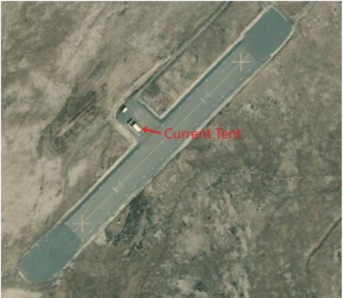
Figure 2-2. Current Location of the Tent at UAS Runway