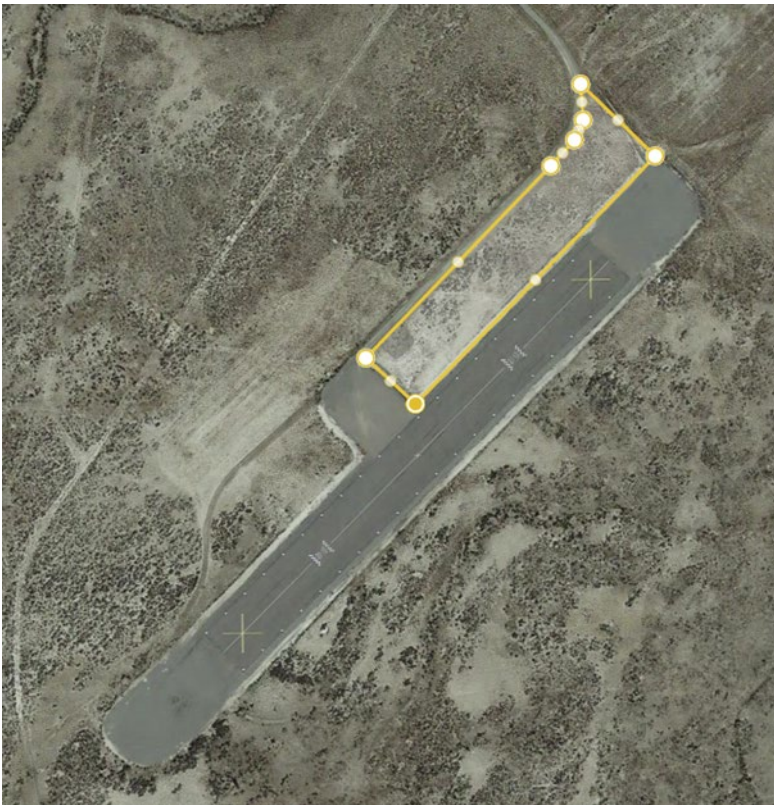
Figure 3-1. Proposed Location of Large Gravel Area

To pave the central gravel pad, a minimum of 3" of asphalt will be placed around B16-612 UAV Metal Shelter on top of existing crushed gravel. The area to be paved is approximately 17,000 square feet minus the footprint of the metal shelter (1500 sq ft). See Figure 3-2 for the proposed location of the area to be paved.