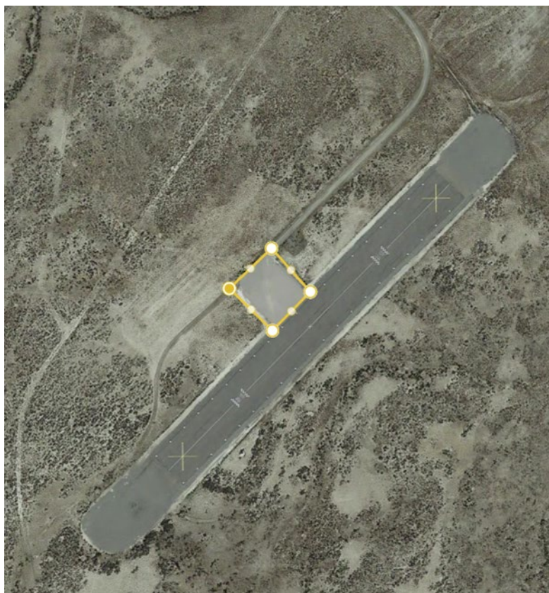
Figure 3-2. Proposed Location to be Paved with Asphalt

Currently, the Unmanned Aerial System UAS runway has no commercial power service. This severely limits operations and testing by placing reliance on portable power sources. As the UAS test range expands there is an ever-increasing need for reliable commercial power. This scope of the work entails extending the medium voltage power lines from the Experimental Field Station area to the UAS, and providing a 75Kva pole mount transformer, 400A 42 circuit panel board, disconnect, and various outlets mounted to a back board near the base of the last pole. Four (4) of the power poles will be installed in undisturbed ground and one (1) power pole in the UAS gravel parking lot. Poles will be 50ft class II poles and have a minimum setting depth of 10% of the length of the pole plus 2-feet. Figure 2-1 shows the location of the proposed poles and circuit panel.